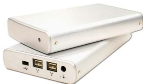
SC-S12CI Back Panel