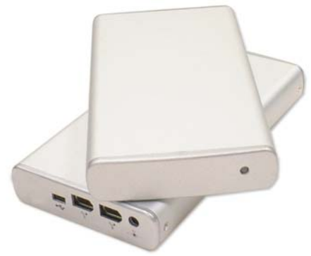
SC-S12CI Back Panel